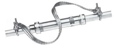
XJG Shown with Optional Bonding Jumper

Bonding jumper width: 0.188"; height: 0.875"