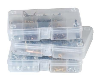
WL01 - Small shock-proof polypropylene component box with 6 compartments Size mm 163x120x30h Weight 0,08 kg

Range of Injection moulded polypropylene organisers.