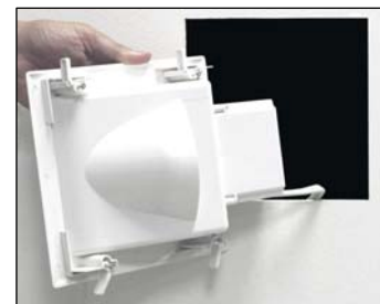
45-0031-WH - Back View