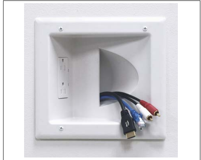
45-0031-WH - Front View