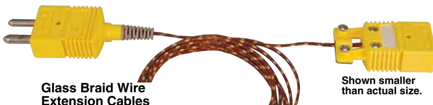
Shown smaller than actual size.