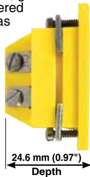
24.6 mm (0.97") Depth