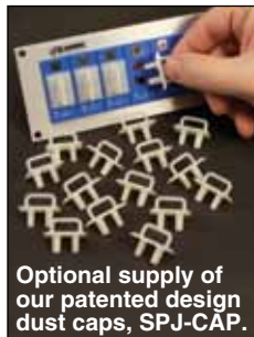
Optional supply of our patented design dust caps, SPJ-CAP.

OMEGA's panel jacks contain two female, collet-type, spring-loaded connectors that will accept any standard male thermocouple connector. The panel jacks are molded of high-impact, glass-filled nylon and are numbered and labeled as well as color-coded.