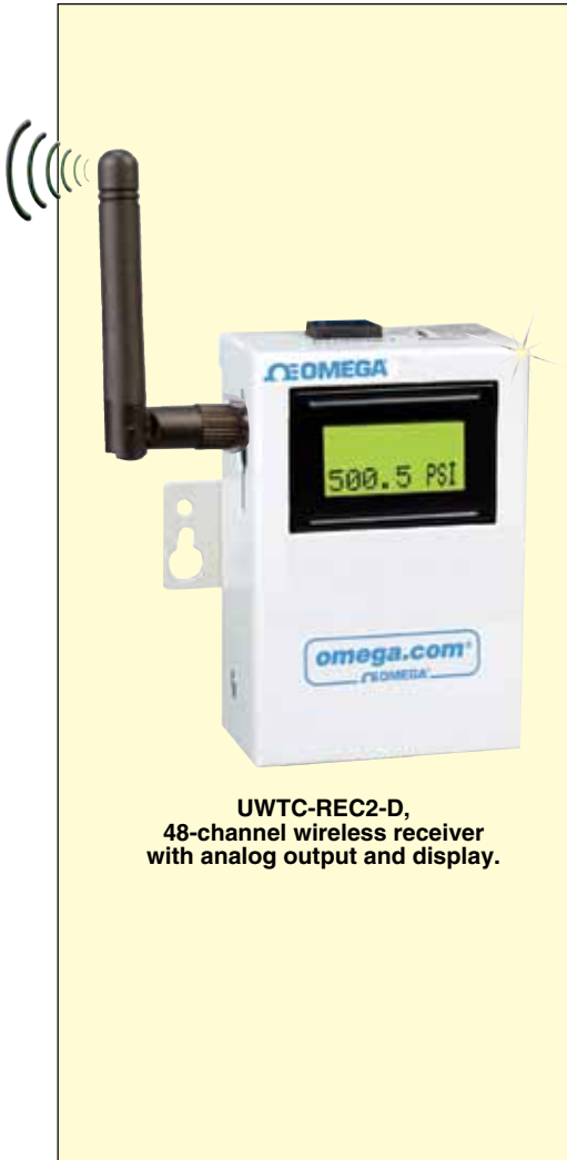
UWTC-REC2-D, 48-channel wireless receiver with analog output and display.

The DPG configuration wizard provides a convenient USB interface with your device. Please refer to the manual for details on setting up your device.