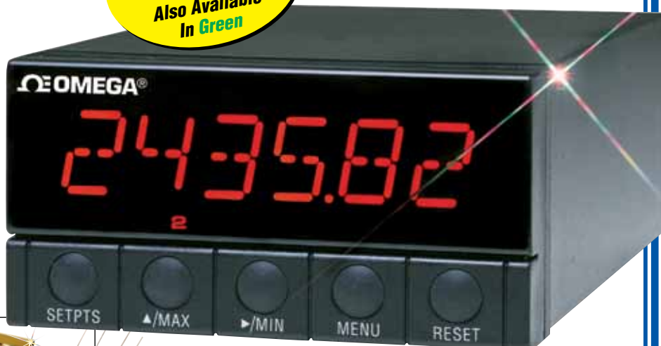
DP41-S, shown smaller than actual size.