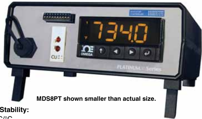
MDS8PT shown smaller than actual size.