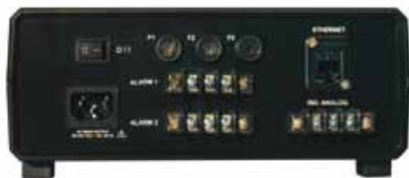
Single channel shown with dual alarm, ethernet, and isolated analog.

Power: 90 to 240 Vac, 50 to 60 Hz Note: Power cords for 120 Vac operation are available. See "Accessories."