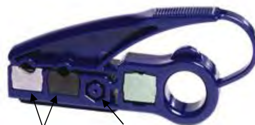
Two in-use cartridges Cable insertion aid.