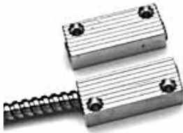
4460 Series Miniature Aluminum Commercial Switch Set