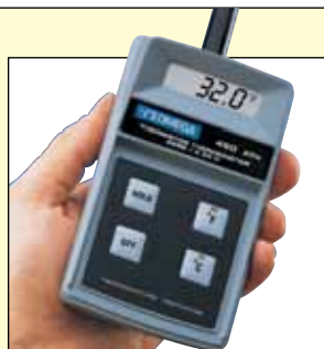
450-ATH high accuracy handheld thermometer.