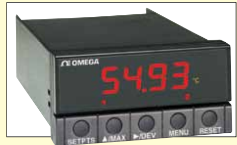
DP25-TH Series 1/2 DIN precision thermistor meter/controllers.