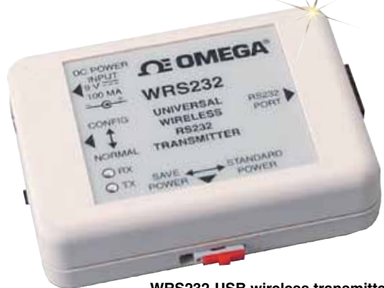
WRS232-USB wireless transmitter, shown close to actual size.

Wireless Connections From Your Sensor to Your Instrumentation: