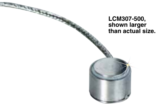
LCM307-500, shown larger than actual size.

Comes complete with 5-point NIST-traceable calibration and 59 kΩ shunt data. * 4-digit meter.