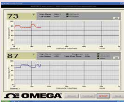
CTXL-DTC PC Application