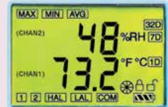
CTXL-TRH—Temperature/Humidity Local Display