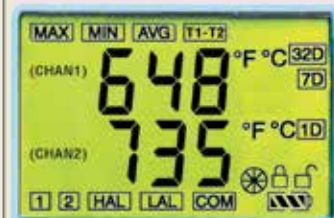
CTXL-DTC—Dual Thermocouple Local Display

Serial PC Communications: RS232, 2-way, 9600 baud