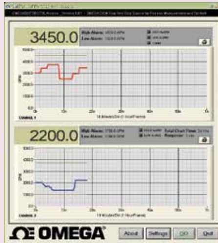
CTXL-DPR PC Application

Battery Status: Indicator on LCD; shows 100, 75%