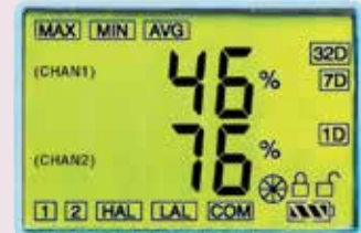
CTXL-DPR—Dual Process Local Display