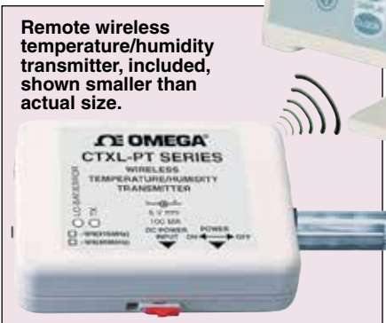
Remote wireless temperature/humidity transmitter, included, shown smaller than actual size.