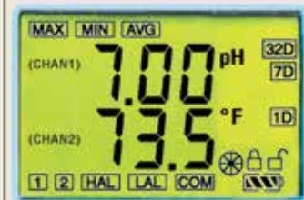
CTXL-PH—pH & RTD Local Display