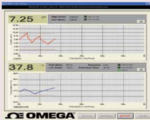
CTXL-PH PC Application