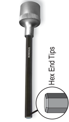
Hex End Tips