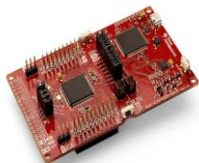
SimpleLink™ MSP432P401R MCU