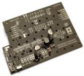
Motor driver and Power distribution board