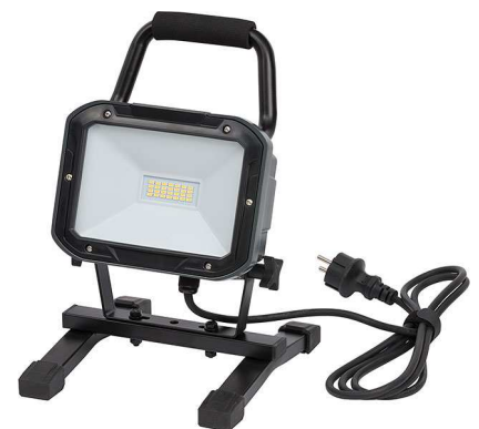
ML DN 2806 S IP54