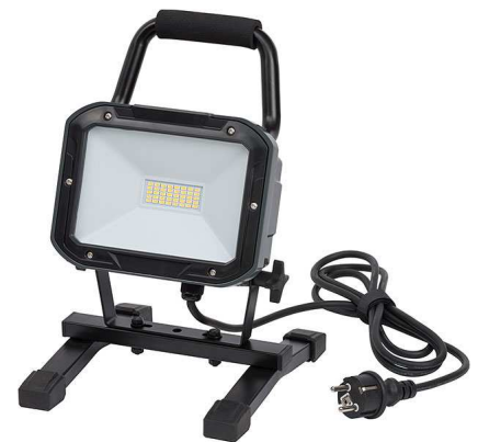
ML DN 4006 S IP54