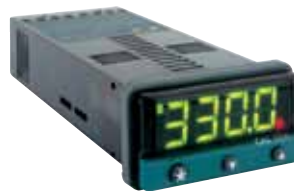
Model 3300 48 x 24 mm (1/32 ND DIN)