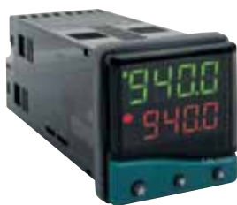
Model 9400 48 x 48 mm (1/16 TH DIN)

Integrated auto-tune makes P.I.D. control simple and efficient, while the unique dAC function minimises overshoot problems associated with conventional P.I.D. Controllers.