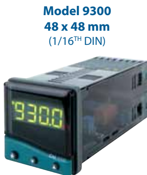
Model 9300 48 x 48 mm (1/16 TH DIN)