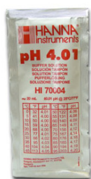
pH 4.01 buffer solution part no: HI 70004P