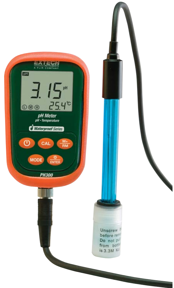
Large blue backlit dual LCD display with calibration and memory indicators