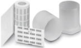
The figure shows the EML (15X9)R SR product variant

Label, Roll, silver/matt, unlabeled, can be labeled with: THERMOMARK ROLL, THERMOMARK ROLL X1, THERMOMARK X, THERMOMARK S1.1, Mounting type: Adhesive, Lettering field: 26.5 x 7.5 mm