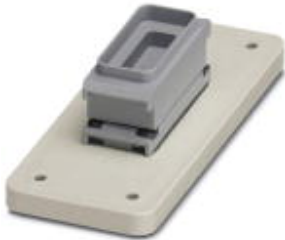
Adapter plate, size B16, reinforced, including panel mounting frame with DSUB 9 protective cover and without contact insert

Please be informed that the data shown in this PDF Document is generated from our Online Catalog. Please find the complete data in the user's documentation. Our General Terms of Use for Downloads are valid ( http://phoenixcontact.com/download )