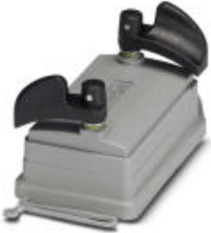
HEAVYCON ADVANCE IP65 protective cover B6, with bayonet locking, with retaining cord, diameter of retaining cord eyelet 3 mm

Please be informed that the data shown in this PDF Document is generated from our Online Catalog. Please find the complete data in the user's documentation. Our General Terms of Use for Downloads are valid ( http://phoenixcontact.com/download )