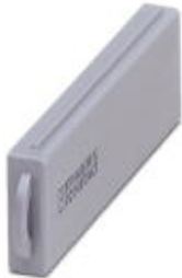
VARIOCON dust cover for panel mounting frame, with IP40 protection, type 3

Please be informed that the data shown in this PDF Document is generated from our Online Catalog. Please find the complete data in the user's documentation. Our General Terms of Use for Downloads are valid ( http://phoenixcontact.com/download )