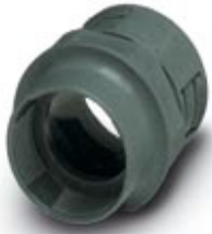
Corrugated tube screw connection, for flexible single wire entry, for connector housings, size Pg16

Please be informed that the data shown in this PDF Document is generated from our Online Catalog. Please find the complete data in the user's documentation. Our General Terms of Use for Downloads are valid ( http://phoenixcontact.com/download )