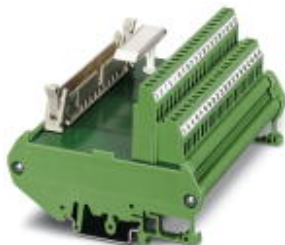
VARIOFACE interface module for Siemens SIMATIC® S7-300, with SIMATIC®-specific labeling (1 - 40), with screw connection, module width: 113 mm

Please be informed that the data shown in this PDF Document is generated from our Online Catalog. Please find the complete data in the user's documentation. Our General Terms of Use for Downloads are valid ( http://phoenixcontact.com/download )