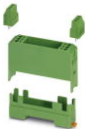
Electronic housing set, consisting of electronic housing and printed circuit termination blocks, pitch 5

Please be informed that the data shown in this PDF Document is generated from our Online Catalog. Please find the complete data in the user's documentation. Our General Terms of Use for Downloads are valid ( http://phoenixcontact.com/download )