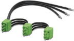
Figure shows variant for 3 modules

3-phase loop bridge for 10 CONTACTRON modules, with screw connection and 22.5 mm housing width, connecting cable: 0.3 m, with ferrules.