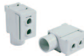
Type/Cat. No: P50UB Description: Modular Direct Power Feed