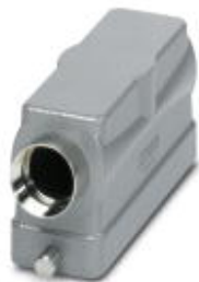
HEAVYCON sleeve housing B6, for single locking latch, height 72 mm, with support 1x M20, lateral conductor exit

Please be informed that the data shown in this PDF Document is generated from our Online Catalog. Please find the complete data in the user's documentation. Our General Terms of Use for Downloads are valid ( http://phoenixcontact.com/download )