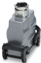
HEAVYCON B24 coupling housing, with double locking latch, height: 81.5 mm, with 1 x Pg21 screw connection, straight cable outlet

Please be informed that the data shown in this PDF Document is generated from our Online Catalog. Please find the complete data in the user's documentation. Our General Terms of Use for Downloads are valid ( http://phoenixcontact.com/download )