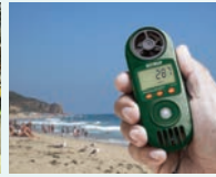
UV Level (EN150)