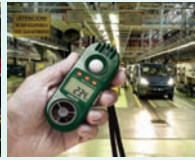
Light Level (EN100)