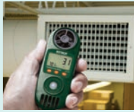
Air Velocity/Air Flow