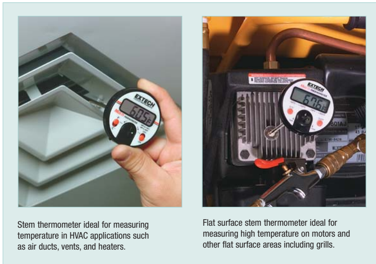
Stem thermometer ideal for measuring temperature in HVAC applications such as air ducts, vents, and heaters.