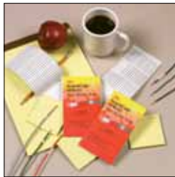
3M™ ScotchCode™ Wire Marker Books