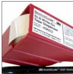
3M™ ScotchCode™ Write-On Dispensers