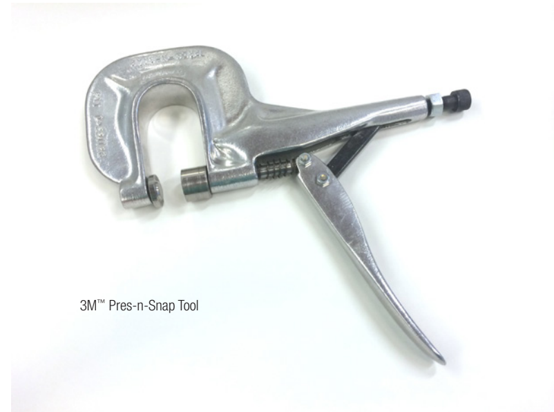
3M™ Pres-n-Snap Tool