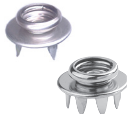
3M™ Female 4-Prong Snap FPSNAP and 3M™ Female 8-Prong Snap 3050

Prong Clinch snaps are held in place by pushing the prongs through the mat and crimping them on the bottom of the mat.