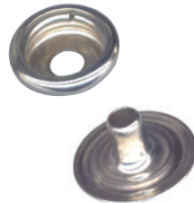
3M™ Female Snap SNAPSOCKET3/8 and 3M™ Female Snap and Eyelet 3034

Socket snaps are held in place by crimping the tip of an eyelet through the center of the socket with a snap tool. This traps the mat between the socket on the top of the mat and the eyelet on the back of the mat. 10 sockets and eyelets are included in each pack.