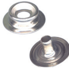
3M™ Male Snap SNAPSTUD3/8 and 3M™ Male Snap and Eyelet 3033

Stud snaps are held in place by crimping the tip of an eyelet through the center of the stud with a snap tool. This traps the mat between the stud on the top of the mat and the eyelet on the back of the mat. 10 studs and eyelets are included in each pack.