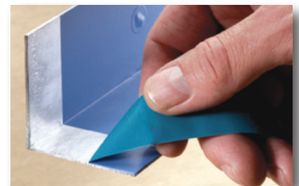
Clean removal, sharp paint edge.