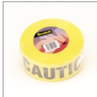
*Scotch 300 pictured