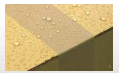
Scotch<sup>®</sup> Box Sealing Film Tapes resist moisture encountered in storage and shipping through the supply chain.