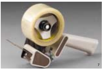
Scotch<sup>®</sup> Box Sealing Tape Dispenser H-180 Lightweight, pistol-grip dispenser with built-in adjustable brake for tight, consistent seal. Up to 48 mm (2 inch) wide tape. Also available: H-183 for 72 mm wide tape.