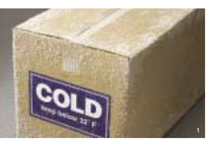
Scotch<sup>®</sup> Box Sealing Tapes are an outstanding choice for applications where tape is applied below 40°F.