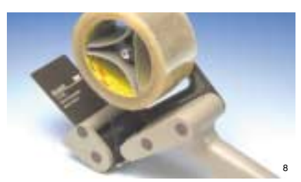
Scotch® Box Sealing Tape Dispenser H-1755 Hand-held, portable dispenser. Excellent on center seam sealing of regular slotted boxes. Sturdy, durable, easy to load and operate. Up to 48 mm (2 inch) wide tape. Plastic and metal construction.