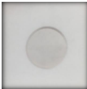
t = 0 sec