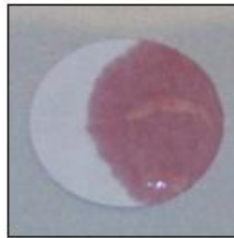
t = 5 sec.