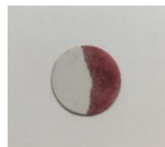
t = 60 sec

1 drop of water place at edge of ½” diameter circle @ t = 0 sec