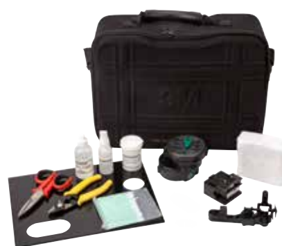
3M™ Crimplok™+ SC/APC Connector Kit 8765T-APC for 3M™ Crimplok™+ Connectors 8700-APC