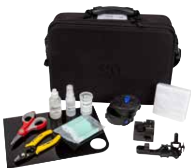
3M™ Crimplok™+ SC/UPC Connector Kit 8765T-UPC for 3M™ Crimplok™+ Connectors 8700-UPC and 6700 Series

3M™ Crimplok™+ Connector Kits 8765T-UPC/8765T-APC provide the tools needed to terminate 3M Crimplok+ Connectors 8700-UPC 6700 and 8700-APC series, respectively. Both kits contain the same fiber preparation tools including a high quality cleaver, a work surface and a case with an integrated hook for easy hanging. Each kit contains a specific 3M™ Crimplok™+ Activation Tool and 3M™ Crimplok™+ Nano Finishing Tool, depending upon the connector type. UPC tools provide a square finish while APC tools provide a 8° angled finish.