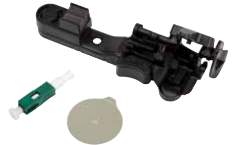
3M™ Crimplok™+ Activation Tool, a Singlemode SC APC 250/900um connector and a lapping film