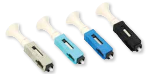
3M™ No Polish SC/UPC Connectors

The No Polish Connector meets EIA/TIA 568-B.3, IEC requirements and is RoHS Compliant.*