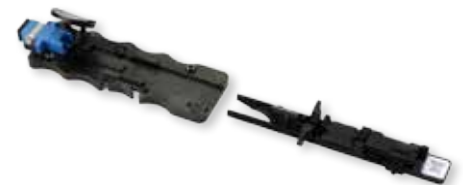
3M™ No Polish SC Connector Assembly Tool 8865-AT