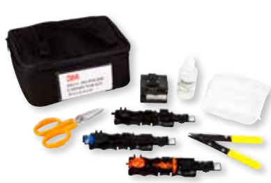
The 3M™ No Polish Connector Kit with Cleaver 8865-C includes all the tools necessary for installation.