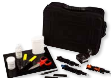
The 3M™ No Polish Connector Premium Kit 8865-C/PR has all of the tools of the 8865-C in a larger case that can hang by a hook and includes a work surface, fiber shard container, tweezers, brush and lint-free wipes in a tub.