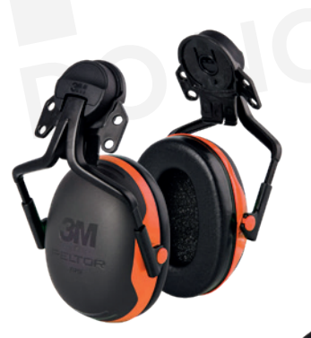
X1P5E – 3M<sup>™</sup> PELTOR<sup>™</sup> X Series Earmuff Helmet Mounted