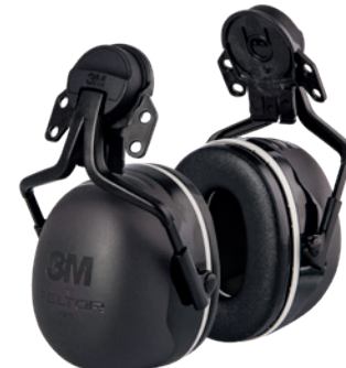
X3P5E – 3M™ PELTOR™ X Series Earmuff Helmet Mounted