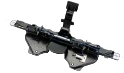
3M™ Fibrlok™ Angle Splice Assembly Tool 2501-AS