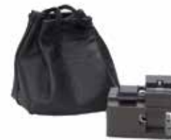
3M™ Cleaver 2534

The 3M Fibrlok Splice Kits for flat splices are available with (2559-C) and without (2559) and contain all the materials needed to terminate 3M™ Fibrlok™ Splices whether it be a singlemode or multimode splice. Detailed instructions are also provided. Included in the kits are the 3M™ Fibrlok™ II Assembly Tool 2501 and 3M™ Fibrlok™ 250 μm Assembly Tool 2504G, simple-to-use tools designed for fast and easy installation.