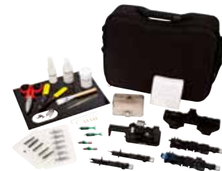
3M™ Fiber Optic Angle Cleaver Kit 2565 includes 3M™ Fiber Optic Angle Cleaver 2535, 3M™ Fibrlok™ Angle Splice Assembly Tool 2501-AS and all tools necessary for 3M™ Fibrlok™ Angle Splices.

The 3M Fiber Optic Angle Cleaver Kit 2565 provides the tools to terminate the 3M Fibrlok Angle Splice 2529-AS and 2540-AS. Also included in the kits are the 3M No Polish Connector Assembly Tools 8865-AT and 8835-AT for terminating SC and LC angle splice connectors. Replacement parts are available.