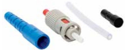
3M™ Crimplok™ ST Connector

By using proven malleable metal element fiber-gripping technology, these connectors are designed to be easily installed virtually anywhere without the need for electrical power.