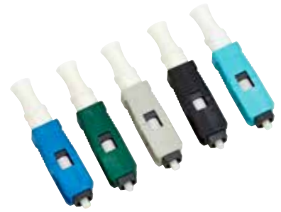
3M™ Crimplok™+ 250μm/900μm Connector Family