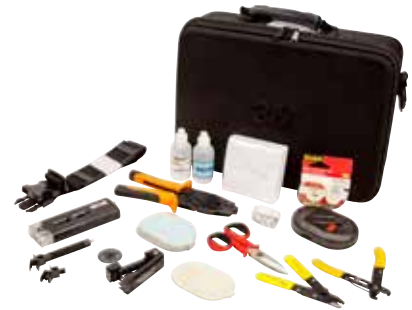
3M™ Crimplok™ Kit 6955 (components loaded in pouch)