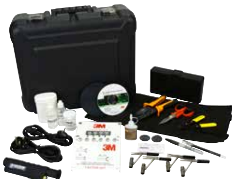
3M™ Hot Melt Termination Kits 6366 and 6362-230V

3M™ Hot Melt Termination Kits 6366 (120V oven) and 6362 (230V oven) contain the tools and materials necessary to terminate 3M™ Hot Melt SC, ST, and FC Connectors, both singlemode and multimode. The 3M™ LC Hot Melt Expansion Kit 6650-LC is used in addition to the 6366/6362 hot melt termination kits to terminate 3M™ Hot Melt LC Connectors.