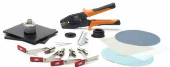
3M™ Hot Melt LC Expansion Kit 6650-LC