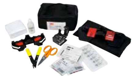
3M™ Fibrlok™ Splice Kit with Cleaver 2559-C

The 3M Fiber Optic Angle Cleaver Kit 2565 provides the tools to terminate the 3M Fibrlok Angle Splice 2529-AS and 2540-AS. Also included in the kits are the 3M No Polish Connector Assembly Tools 8865-AT and 8835-AT for terminating SC and LC angle splice connectors. Replacement parts are available.