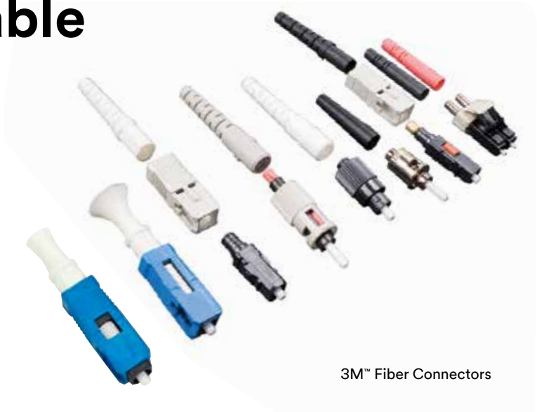
3M™ Fiber Connectors

Reliability and a craft-friendly installations make 3M field installable connectors popular among contractors and industry professionals. 3M connectors can help maximize time in the field with factory-prepped shortcuts and high performance tools. Choose from a full line of fiber connectors with ceramic ferrules.