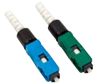
3M™ Crimplok™+ Singlemode Jacketed Connectors