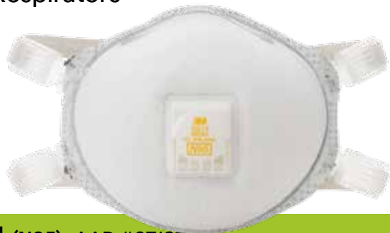
8214 (N95) AAD #07187

A respirator designed for applications where metal fumes are present, including those with ozone* and nuisance level organic vapors.** Plus a comfortable foam face seal.