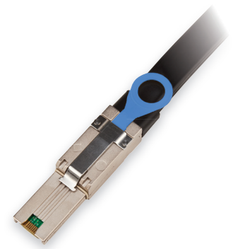
3M™ High Routability External MiniSAS Cable Assembly