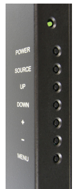
On Screen Display (OSD) Panel

Audio (in/out) VGA DVI HDMI DisplayPort Serial (in/out) Serial Touch USB Touch AC Input On/Off