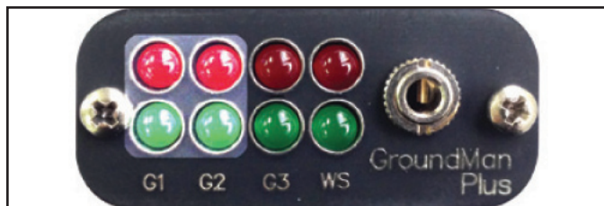
Figure 3. LED lights used to set resistance alarm level.