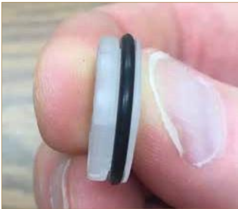
CURRENT PISTON SEAL DESIGN