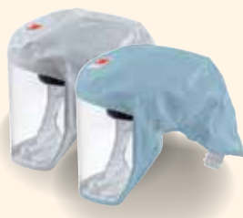
3M™ Versaflo™ Headcover S-133 and S-133B Head and face coverage. Integrated Comfort suspension. General purpose fabric.